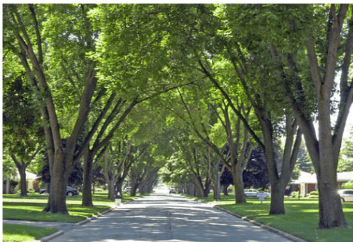
Ash trees before EAB devastation -- Belvedere Dr., Toledo, OH, June 2006.

Since then, university scientists have developed and refined treatment protocols that can protect healthy ash trees from EAB and help conserve the urban forest.